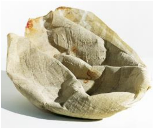
Eva Hesse (right)