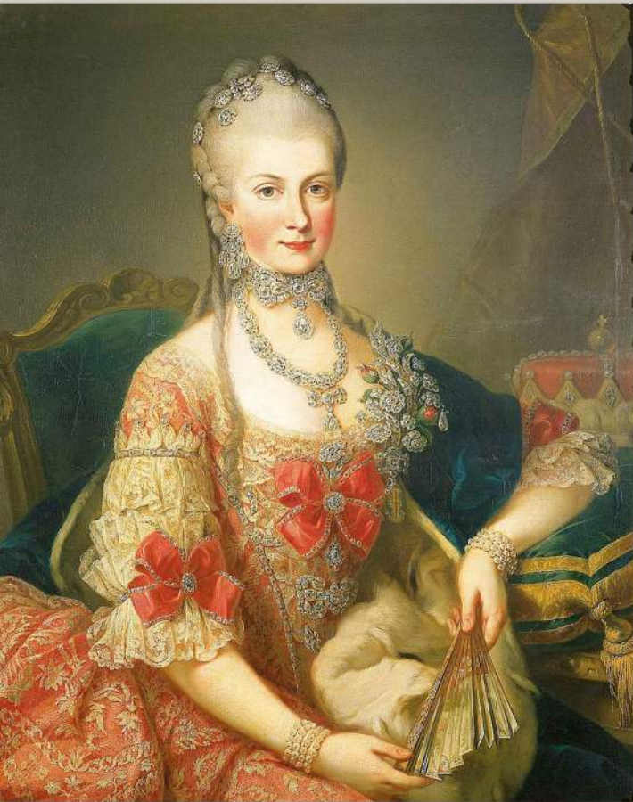
Archduchess Marie Christine, Duchess of Teschen, c.1765 Martin Van Meytens

Make and decorate a beautiful paper fan, the fashionable Georgian accessory! Have fun drawing and collaging the front ... and why not use the other side to share a positive message.