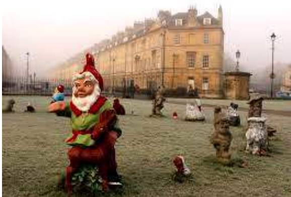
Djordje Ozbolt, 2016