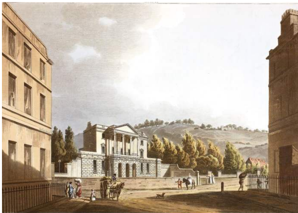
Front of Sydney Hotel, 1805

This is your chance to Change the Face of the Holburne!