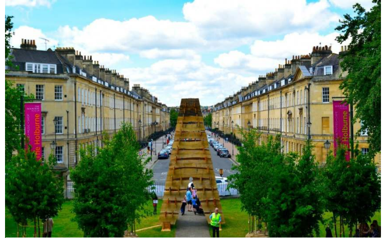
Forest of the Imagination, 2019