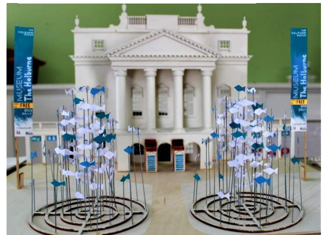
BSU student design idea for front lawn