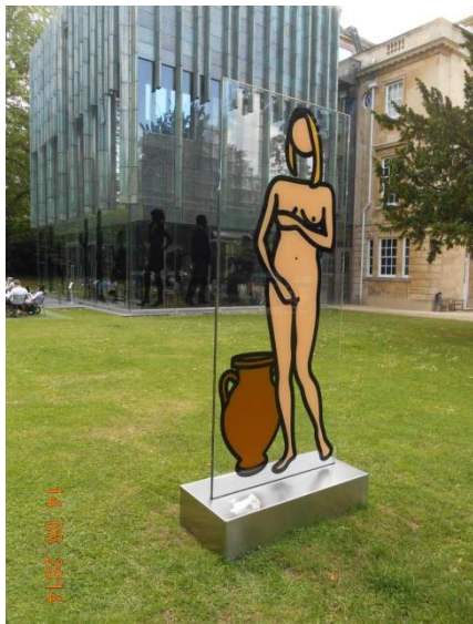
Julian Opie, 2014