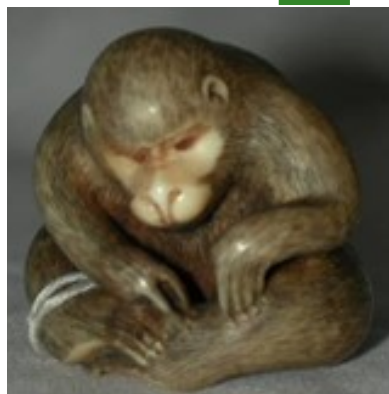
Netsuke from the Holburne's collection. We are currently making a photographic record of all our netsuke as many are not on display.