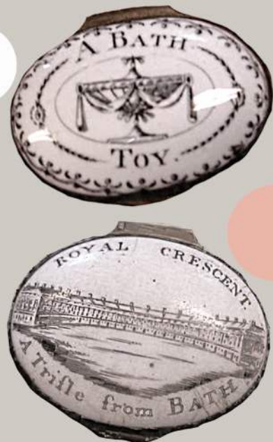
Patch boxes, 'A Bath Toy' and 'View of Bath: Royal Crescent', enamelled copper, c.late eighteenth century, The Holburne Museum Collection

Patch boxes were made to contain beauty spots or face patches. They often had a mirror inside. Beauty spots were all the rage in the seventeenth and eighteenth centuries. They were worn by fashionable people to cover marks left by a disease called 'the pox' or to highlight a pretty complexion! These enamel patch boxes were sold as souvenirs showing views of Bath.