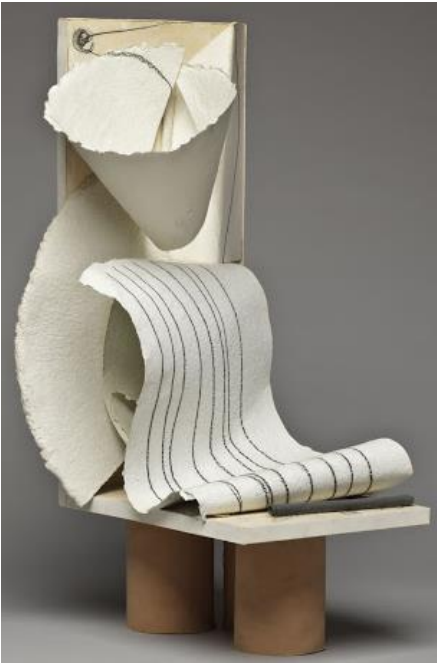
Sir Anthony Caro (above + below) Calder