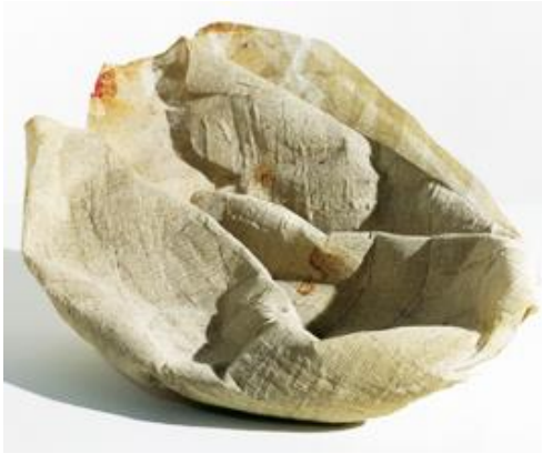
Eva Hesse (right)