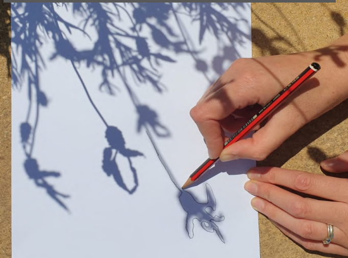
Drawing a shadow on white paper

If you have a printer you can print a frame to surround your image. Otherwise you can use any card, paper, foil or even fabric!