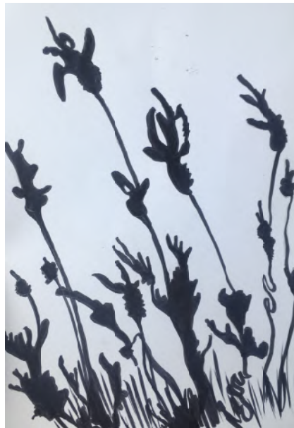
Coloured Shadow Silhouette

Please share an image of what you've made ...We love to see your creations!